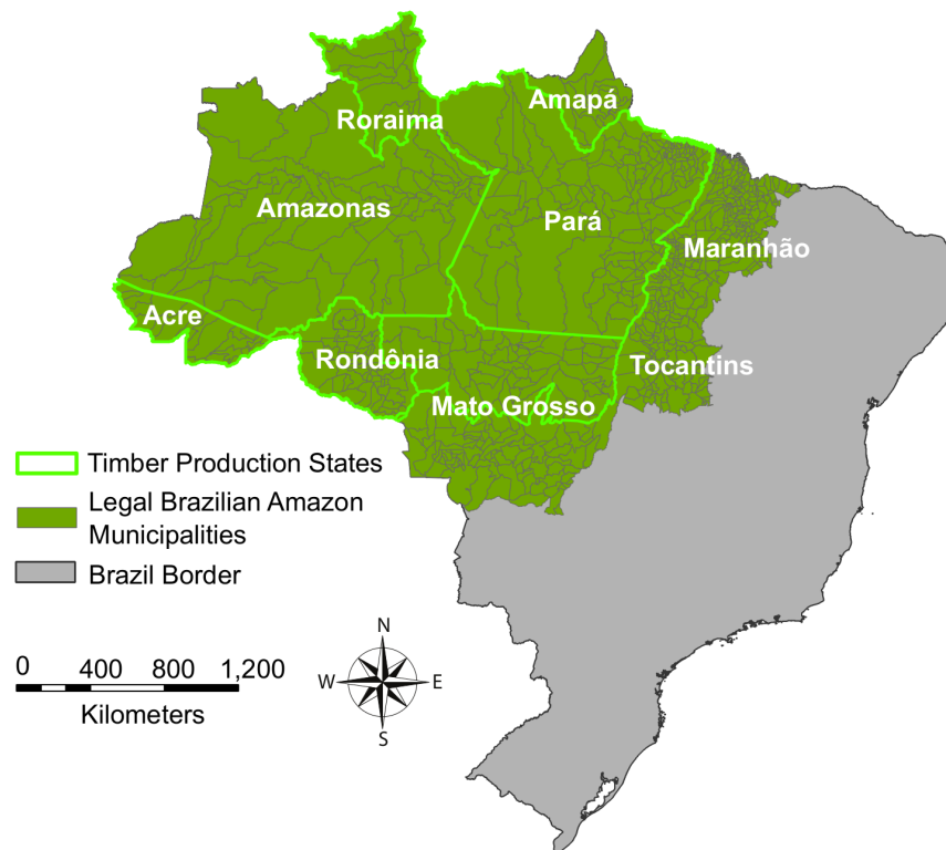
Figure 1. Map of the Legal Brazilian Amazon municipalities (dark green with grey borders) and the five timber production states (bright green borders): Roraima, Pará, Rondônia, Acre, and northern Mato Grosso. doi:10.1371/journal.pone.0085725.g001

We controlled for several sociodemographic risk factors for malaria in the Amazon. Occupational risks were measured using a ratio of male-to-female inhabitants in the municipality and the percent of the population that worked primarily in outdoor occupations such as agriculture, forestry, or fishing and hunting. Socioeconomic status of households was measured using data from the 2000 census on the average number of people living in a household, the percent of the population who receive at or below minimum wage each month, and the percent rural and indigenous populations in each municipality. These data were also proxy measures for housing quality. Access to healthcare was measured by the average cost of transportation to the nearest state capital. GDP growth, transportation costs, and migration rates were calculated by the Brazilian Institute for Geography and Statistics (IBGE) and Brazilian Institute of Applied Economic Research (IPEA) and provided by the Oswaldo Cruz Foundation (FIO-